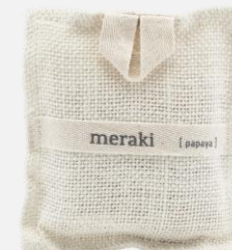
Papaya [ notes: papaya ]