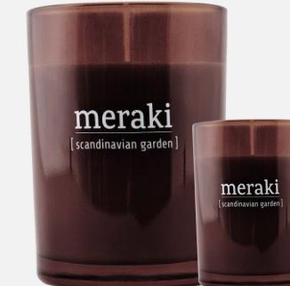
[ notes: Scandinavian garden ]