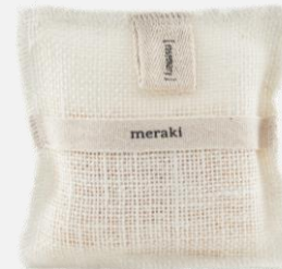
Rosemary [ notes: rosemary ]