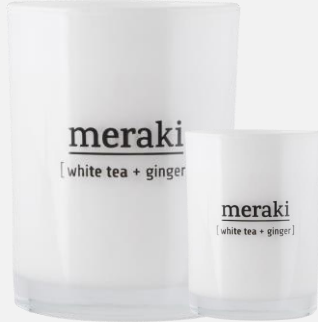
[ notes: white tea, ginger ]