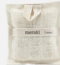
Herbs [ notes: herbs ]