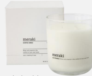
[ notes: rose, magnolia, lily ]