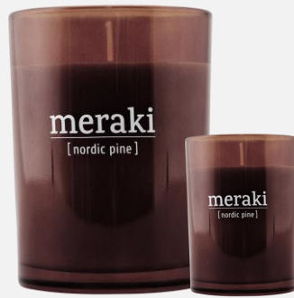
[ notes: Nordic pine ]