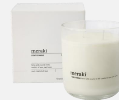
[ notes: orange, florals, oleander, musk ]