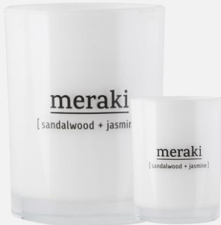
[ notes: sandalwood, jasmine ]