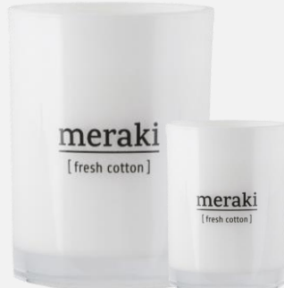
[ notes: cotton ]