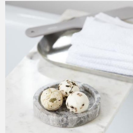
Soap box [ notes: green tea, pomegranate, camomile ]