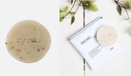
Sesame scrub [ notes: sesame ]