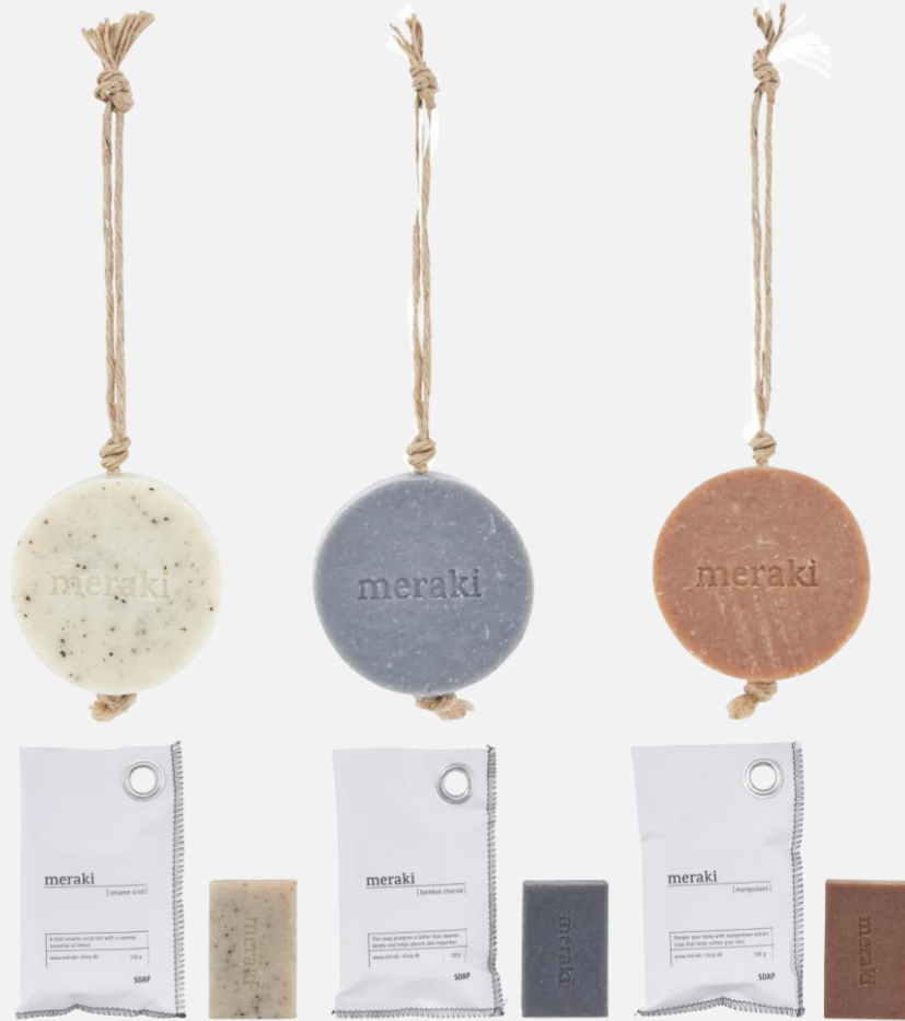
Sesame [ notes: sesame ]