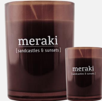
[ notes: vanilla, jasmine ]